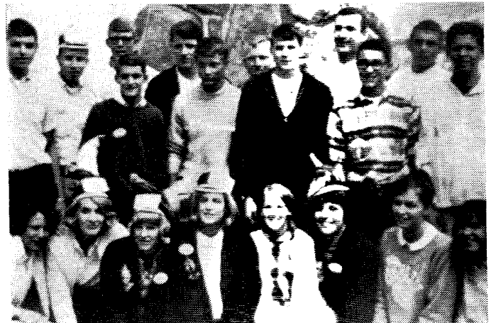
ILLINOIS DELEGATION PAUSES from the "Magic of Cheley" to pose for camera.

THE NATIONAL Student Council Leadership Conference is limited to selected student leaders. The main purpose of the conference was to develop individual leadership techniques through general meetings, discussion groups, work-shop groups, and camp councils.